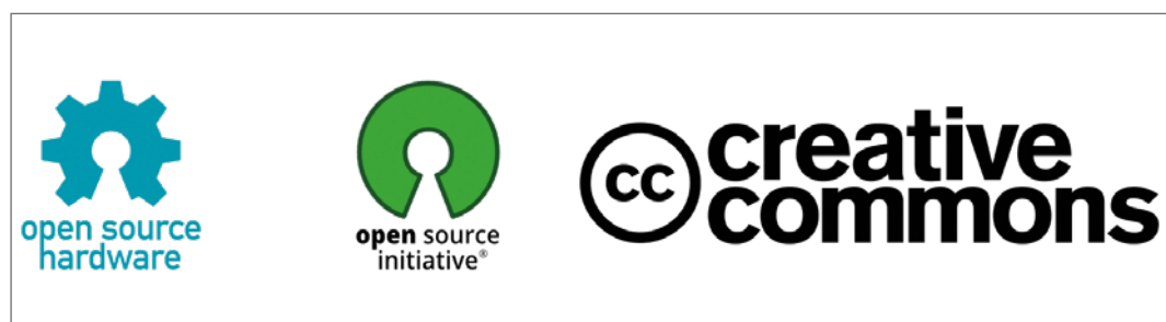
Figure 1: Label for Open Source Hardware by OSHWA, Open Source Initiative (OSI) and Creative Commons (Public domain).

"[OSH] is hardware whose design is made publicly available so that anyone can study, modify, distribute, make, and sell the design or hardware based on that design. The hardware's source, the